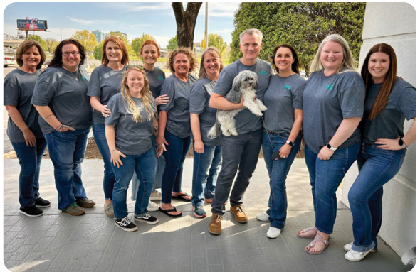
This crew braved the scare of the eclipse traffic in Little Rock and attended the “front office guru training”.